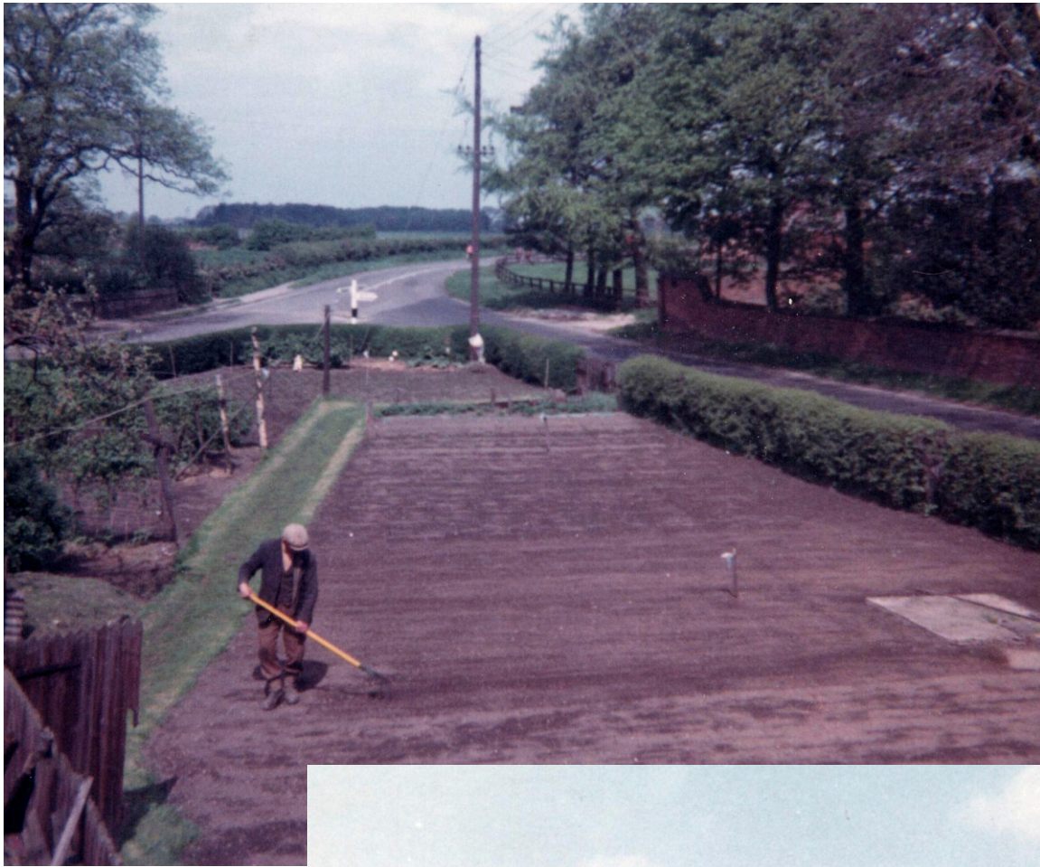
Making the new A19/ Skipwith road junction