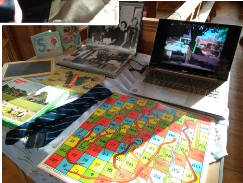
Memories café - Our school days reminiscence table