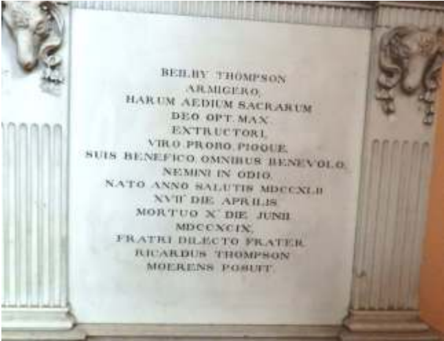
Memorial in baptistery (translation below)