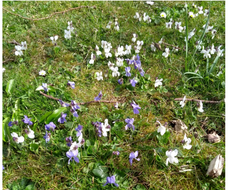
Easter Violets in the Churchyard

Again subject to the Covid situation, we hope to resume our regular Heritage activities from the beginning of July, including the Heritage Group meetings, Heritage Hub and Memories Café. We can't wait!