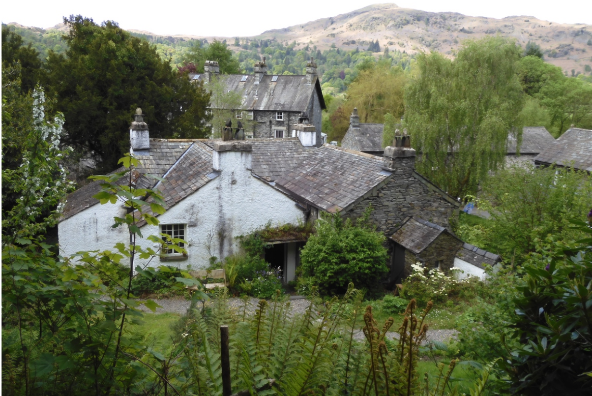
Wordsworth cottage, Grasmere, Lake District

For more information please contact Marion on 01904 720735