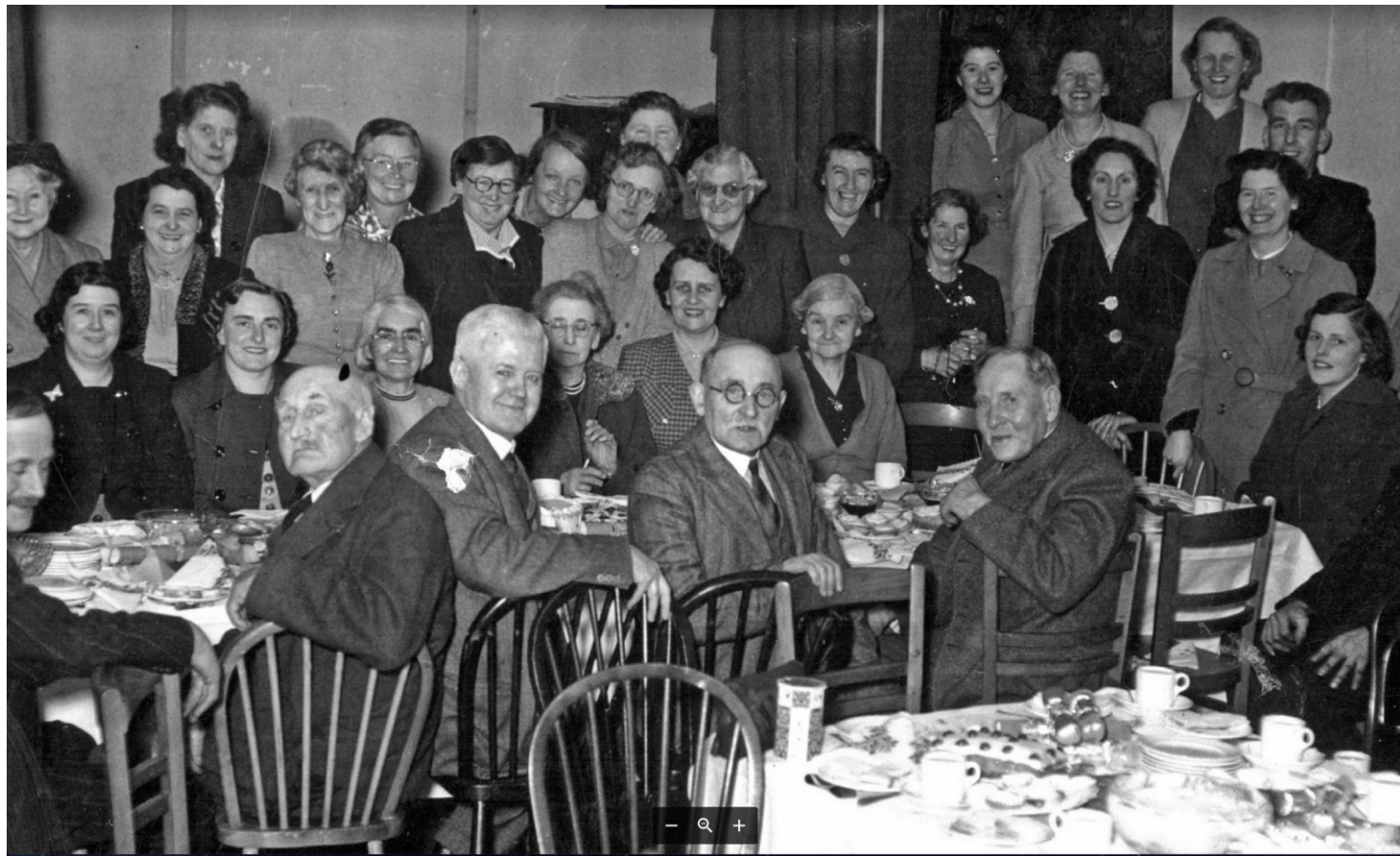
Here is a photo of the Darby and Joan party in the Club on 26th January 1954.